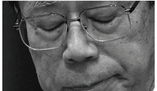
Fujimori after he resigned from his Presidency

When the scandal broke, Fujimori fled to Japan, where his parents were from. When he got there, he gave notice that he wanted to quit being President of Peru. Now Peru got a new president, who restored Peru's government system. The new President brought criminal charges against Fujimori, accusing him of corruption, murder, and other acts against human rights.