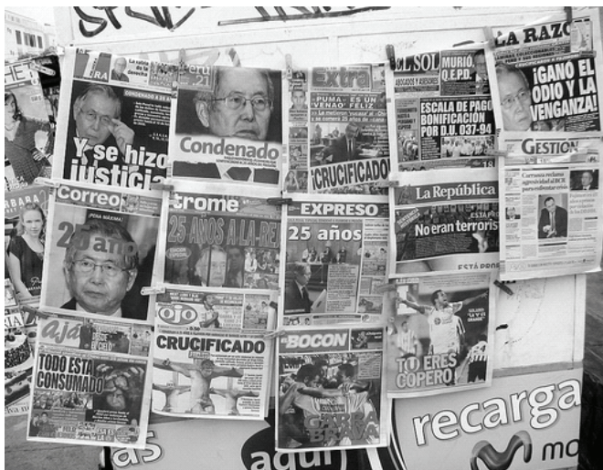
Peruvian newspapers announcing Fujimori's sentence

After five years of hiding in Japan, Fujimori returned to South America. He was sent back to Peru, where he was put on trial for the crimes he committed while he was President. He was convicted of abusing his power and abusing peoples' human rights. For this, he was sentenced to 31 years in prison. Even so, many people in Peru still supported him. When the court announced his sentence, riots broke out.