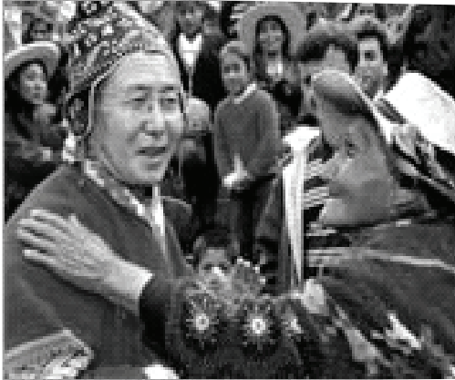
Fujimori with a supporter in traditional Peruvian clothing

Fujimori's control led to some accomplishments. He solved the economic crisis and successfully fought a group of terrorists that had taken control of several regions of the country. Just when things looked so good, however, people began to learn about other things Fujimori was doing. Because he had the power to punish terrorists, thousands of suspected terrorists had been killed without ever having a trial. At the same time, Fujimori had been raising money for himself and his government officials by selling weapons to terrorists in other countries. With the changes Fujimori had made to Peru's government, there was nothing to check his power or make sure he acted fairly and treated people well.