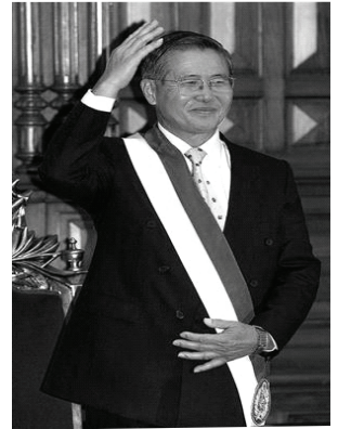
Fujimori after his election in 1990

Fujimori had some ideas for laws he thought would solve the problems, but Peru's Congress would not pass the laws he suggested. This made Fujimori unhappy, so he decided to take matters into his own hands.