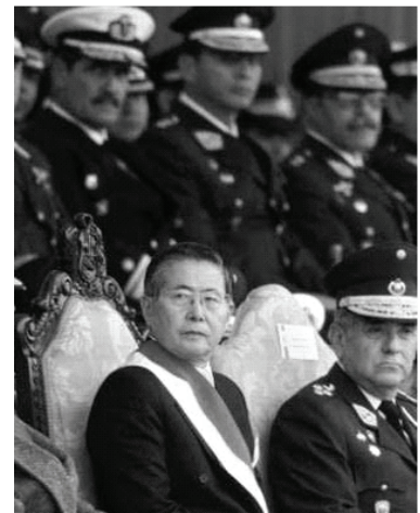
Fujimori with his military leaders

Of course, all of this was illegal under Peru's constitution. To take care of this problem, Fujimori issued a decree that said Peru's Constitution could be ignored. (A decree is like a law issued by a president.) Fujimori's decree also got rid of Congress and gave the president (himself) all the power to make laws. Fujimori then fired almost half of Peru's 23 Supreme Court justices, as well as many other judges around Peru who believed his actions were unconstitutional. In other words, Fujimori took total control of Peru's government.