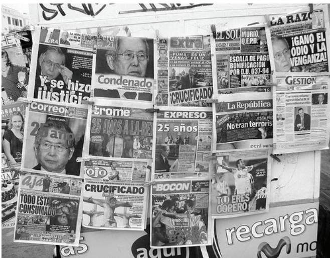
Peruvian newspapers announcing Fujimori's sentence

After five years of hiding in Japan, Fujimori returned to South America. He was sent back to Peru, where he was put on trial for the crimes he committed while he was President. He was convicted of abusing his power and abusing peoples' human rights. For this, he was sentenced to 31 years in prison. Even so, many people in Peru still supported him. When the court announced his sentence, riots broke out.