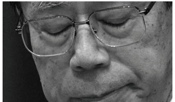
Fujimori after he resigned from his Presidency

When the scandal broke, Fujimori fled to Japan, where his parents were from. When he got there, he gave notice that he wanted to quit being President of Peru. Now Peru got a new president, who restored Peru's government system. The new President brought criminal charges against Fujimori, accusing him of corruption, murder, and other acts against human rights.