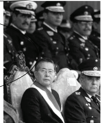
Fujimori with his military leaders

Of course, all of this was illegal under Peru's constitution. To take care of this problem, Fujimori issued a decree that said Peru's Constitution could be ignored. (A decree is like a law issued by a president.) Fujimori's decree also got rid of Congress and gave the president (himself) all the power to make laws. Fujimori then fired almost half of Peru's 23 Supreme Court justices, as well as many other judges around Peru who believed his actions were unconstitutional. In other words, Fujimori took total control of Peru's government.