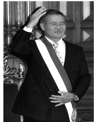
Fujimori after his election in 1990

In 1990, a man named Alberto Fujimori became president of Peru. The first thing Fujimori wanted to do was solve the huge financial problems Peru had been having. Fujimori had some ideas for laws he thought would solve the problems, but Peru's Congress would not pass the laws he suggested. This made Fujimori unhappy, so he decided to take matters into his own hands.