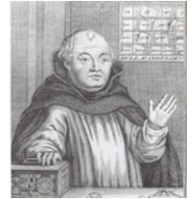
Friar Tetzel would travel around selling indulgences to people.

Tetzel, a friar, sold indulgences. Doctrines of indulgences taught that Christ and the saints had stored up a treasury of merit. Indulgences could reduce the amount of time spent in purgatory; did not bring forgiveness of sin. Indulgences were sold to raise money for the church's increasing expenses. (They were like car salesmen, and lied about them.)